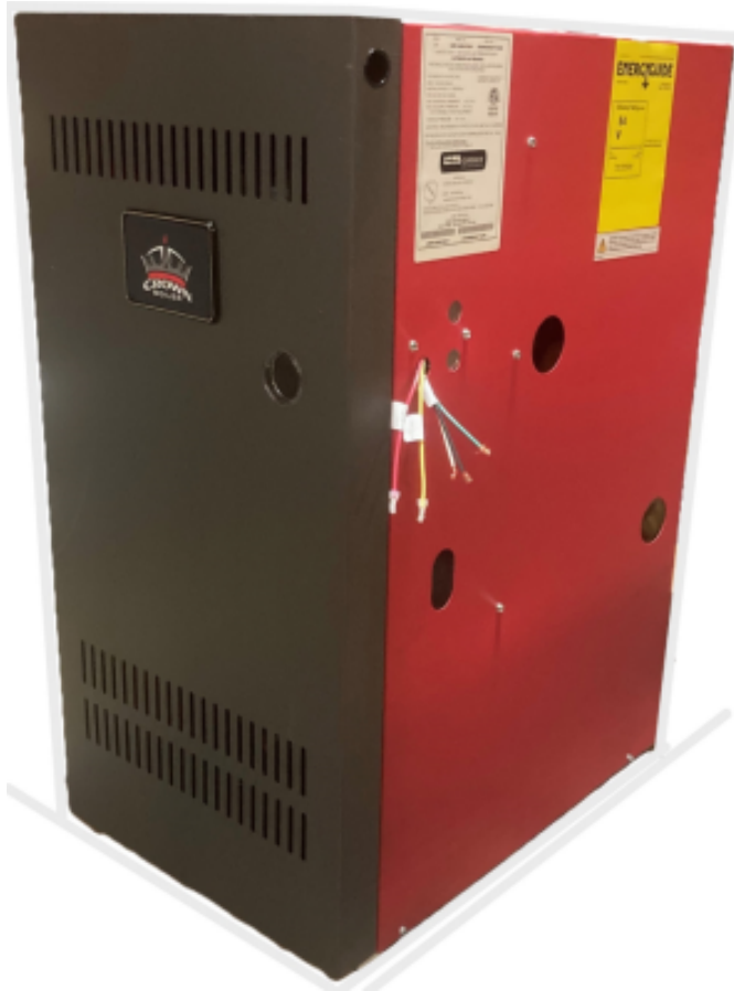
Recalled Crown Boiler gas-fired AWR Series